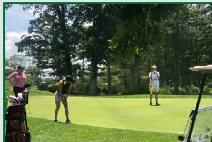
Caddying at Metedeconk National